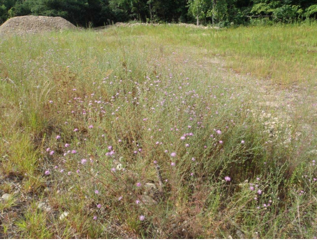
(Left photo) A field of Spotted knapweed along the Farmington River, before its removal