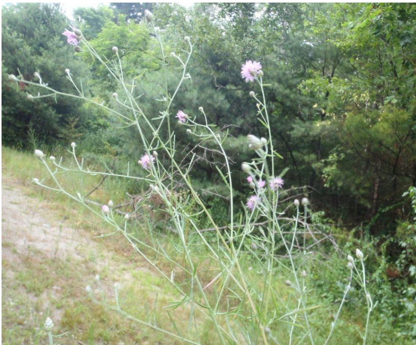
Spotted knapweed ( Centaurea maculosa )

In Connecticut, one important habitat that the plant has invaded is a 14-mile stretch of the upper Farmington River, part of the National Wild and Scenic River System. Each summer, the Farmington River Coordinating Committee (FRCC)—comprised of representatives from five riverfront towns, state agencies, and other community groups—work with teams of professionals and volunteers to remove and destroy invasive