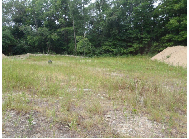
(Right photo) The same field along the Farmington River after Spotted knapweed was removed by AIC Community Service teams

Spotted knapweed isn't the only invasive plant being fought on the banks of the Farmington River. Japanese stiltgrass ( Microstegium vimineum ) is also on the list of dozens of invasive plants that the FRCC works to keep in check. The growth of stiltgrass is at its peak in August, and FRCC is currently looking for volunteers from the local community, and beyond, to help identify areas of invasion and remove the grassy vegetation. The Judicial Branch Community Service Work Crew program will also be assisting that effort.