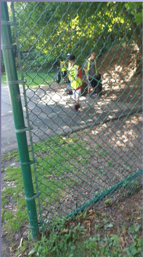
(Above) Community service crews working in the Earle Street Community Garden (Below Left and center) cleaning in Hyland Park (Right and below right) Helping set-up at the CHS National Community Health Center Day event