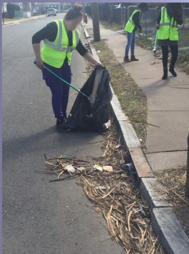
(Left right and below) Cleaning overflowing garbage bins and debris from city streets