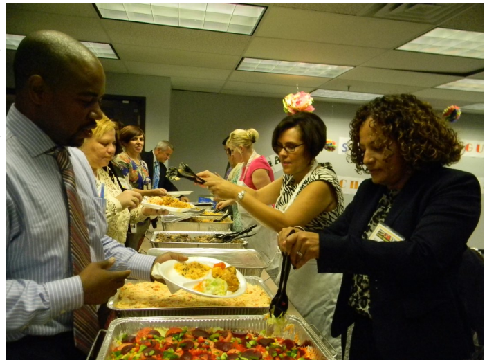
Spanish-style buffet provided by Negrita’s Restaurant, New Britain

Many individual CSSD offices throughout the state have planned individual celebrations for their staff to recognize Hispanic Heritage Month. The next edition of the CCAC Cultural Compass, scheduled to be published before December, will contain brief highlights of those office events.