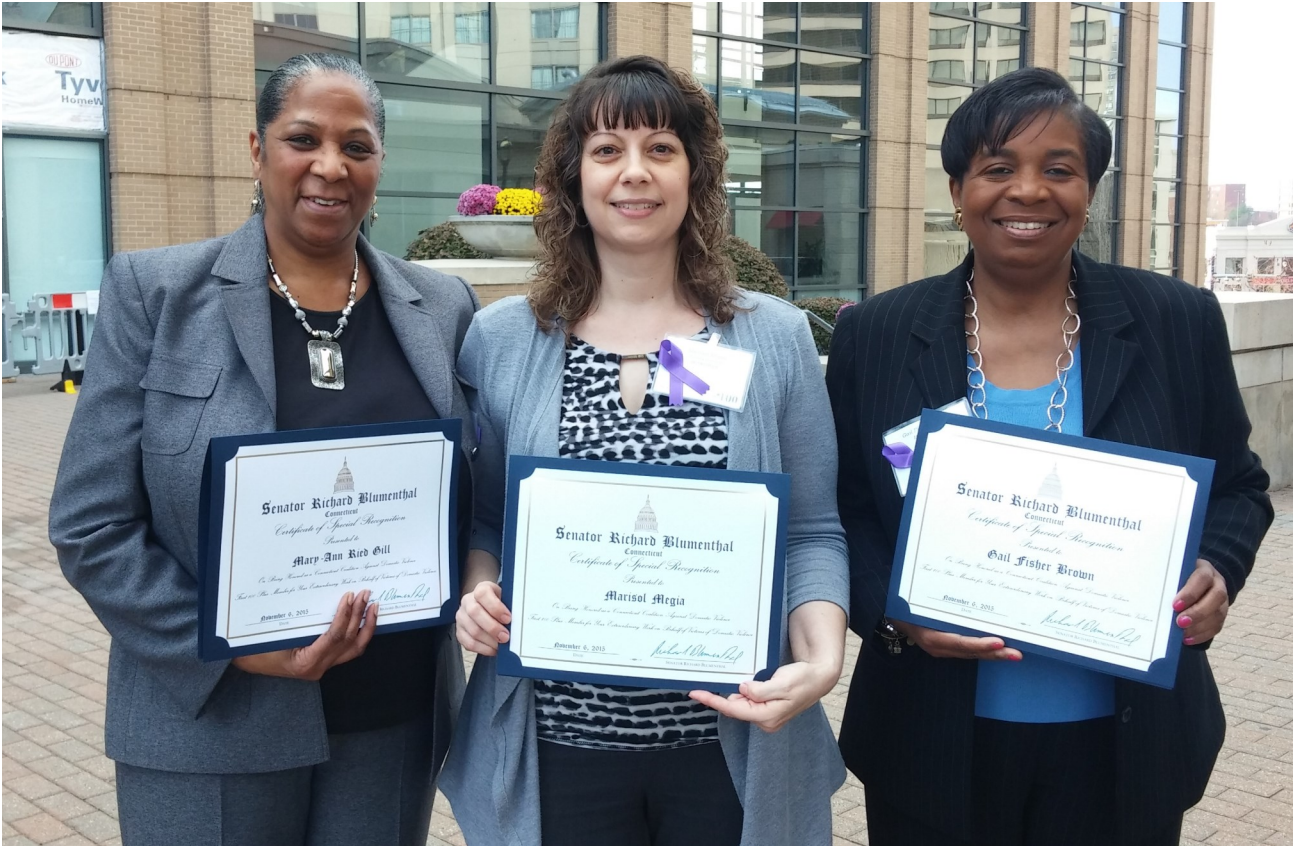
JB/CSSD recipients of the 2015 CCADV First 100 Plus award